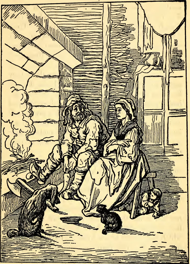
"SLIPPED UNDER HIS FATHER'S SEAT."